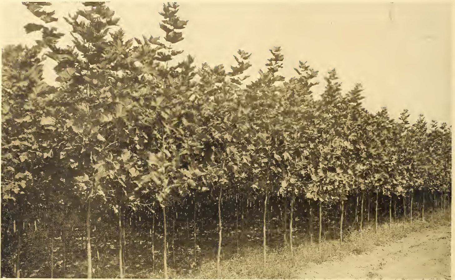
The Oriental Planes Offered Below